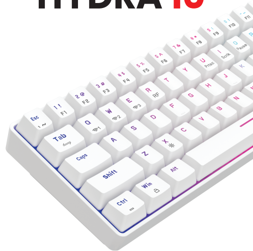
Gaming Wireless Key Board

Note: First charge the keyboard using the wire provided. Type C charging jack.